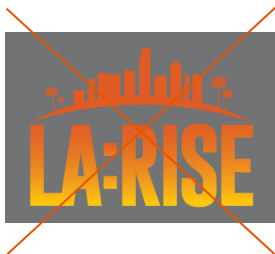
Do not use alternate background colors

Display logo with full LA skyline properly to keep integrity of logo.