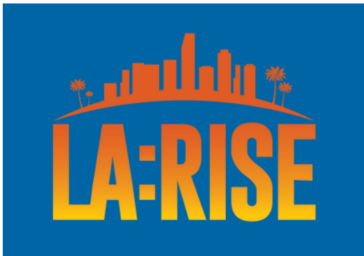
Master Logo with LA:RISE Blue Background

The LA:RISE secondary logos are placed on collateral that uses solid fields of blue or black color. The grayscale b/w logos can be used on collateral that isn't printed in color. If you need to place the logo over a field of color other than blue, be sure use the white box logo. Please visit REDF's website to retrieve logo files: https://redf.org/logos/