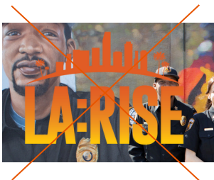
Do not place logo over image

Display logo cleanly on a solid white, blue or black background.