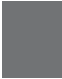
LA:RISE Gray CMYK: 0/0/0/68 RGB: 113/115/117

LA:RISE Gray can be used as tints (see examples below):