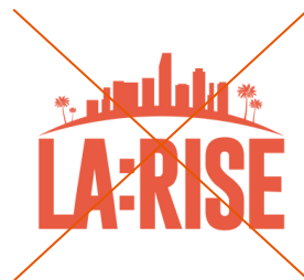
Do not fill logo with solid colors

Display logo cleanly on a solid white, blue or black background.