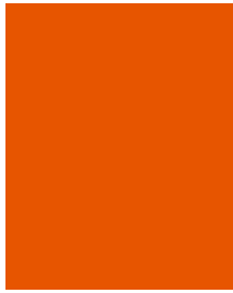
LA:RISE Orange CMYK: 7/78/100/1 RGB: 231/83/0