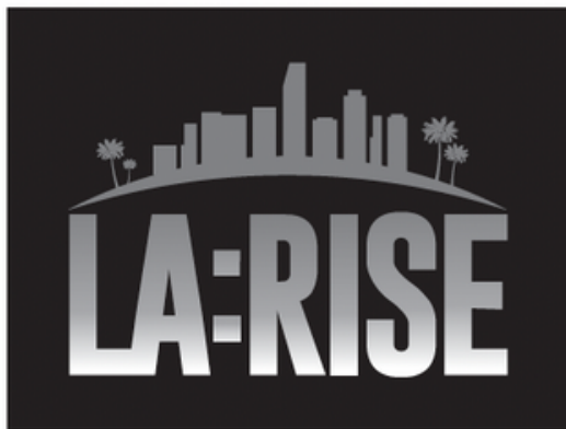
Grayscale B/W Logo with Black Background

*White box logo is shown on green color as an example.