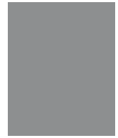
LA:RISE Gray 80%