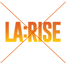
Do not crop logo artwork

Display logo cleanly on a solid white, blue or black background.