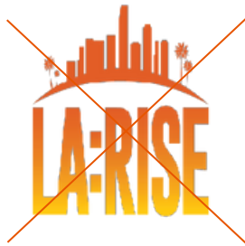
Do not stretch or distort