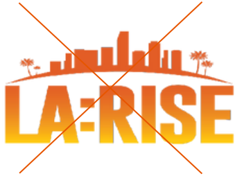
Do not stretch or distort

Please don't edit, change, distort, recolor, or reconfigure the logo. See the examples below on what not to do with the LA:RISE logo.