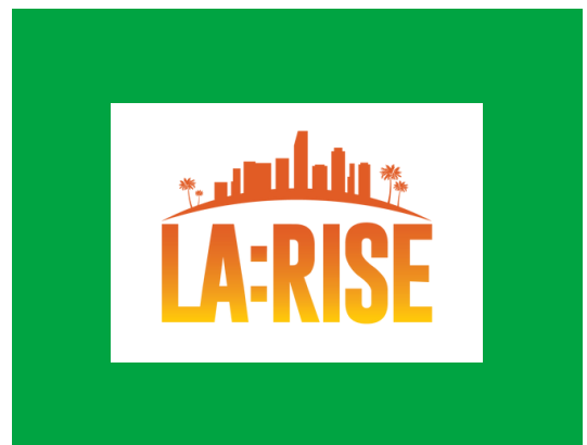
Master Logo with White Box*

Use file: LARISE_NewLogo_Color_BlueBackground_CMYK.eps