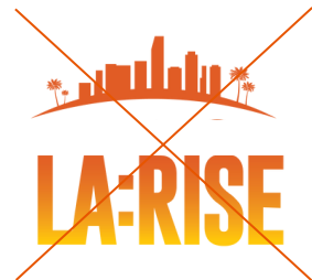
Do not change skyline

Display logo with full LA skyline to keep integrity of logo.