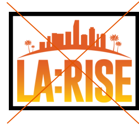
Do not outline logo box

Display logo cleanly on a solid white, blue or black background.